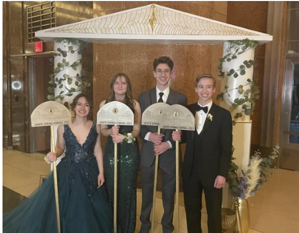
Royal Prom Court